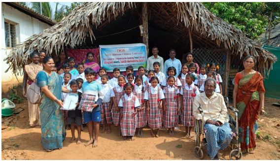
NICE donated school uniforms in April 2025 to a tribal village in Rampachodavaram, East Godavari, Andhra Pradesh