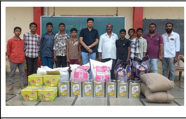
Groceries and essential provisions were distributed to underprivileged children in Thorrur through Vandemataram Foundation.