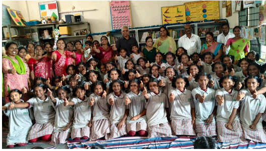
August 2025, SVS Projects India Pvt Ltd Chairman, Managing Director distributed sports dresses to forest/tribal children