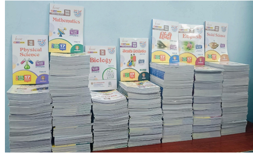
NICE distributed final exam model papers for 10th class students in Chittoor district through RIDO.