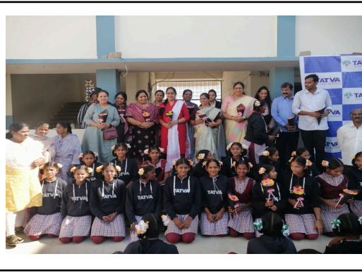
Stationery items, including exam pads and geometry boxes, were distributed with support from the TATVA Team.