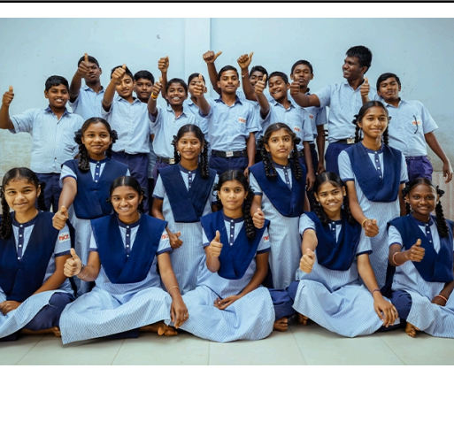
Nice Children thoroughly prepared & ready for their public examinations.