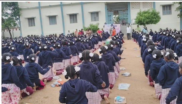
NICE donated uniforms to children of the KGBV School in Balamur, with financial support from TATVA Global School, in June 2025.