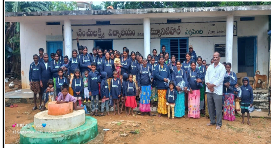
TATVA Supported Sweaters to 2000 tribal people