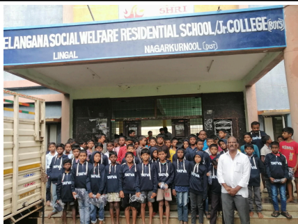
In September 2025, uniforms were distributed to tribal children in Lingala