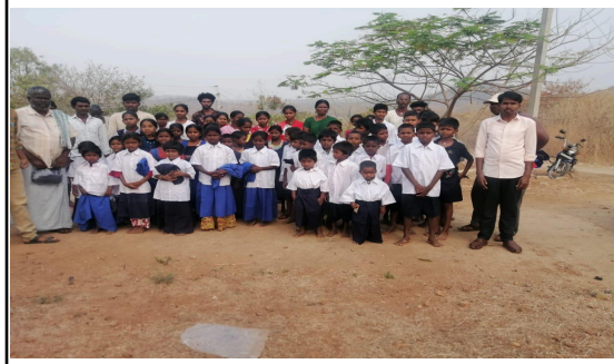
NICE donated Uniforms to Tribal communities in Nagarkurnool District in April 2025.